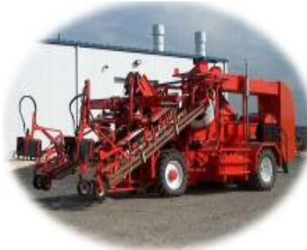
HARVESTING & FIELD EQUIPMENT