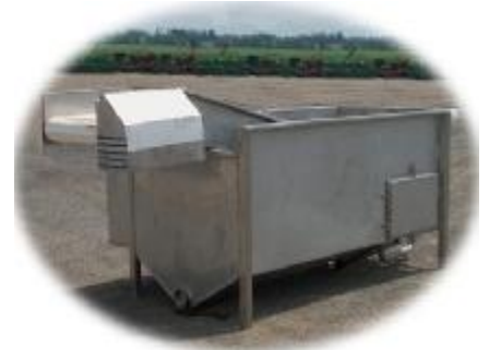
STONE & DIRT SEPARATION