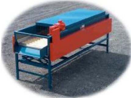
WASHING & DRYING EQUIPMENT