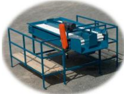
INSPECTION & GRADING EQUIPMENT