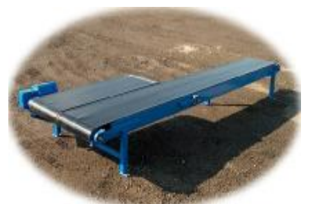
CONVEYORS & ELEVATORS