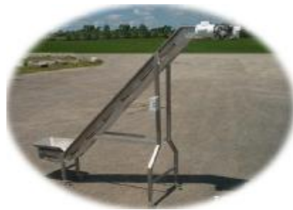
STAINLESS STEEL EQUIPMENT