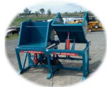
BIN DUMPERS & FILLERS