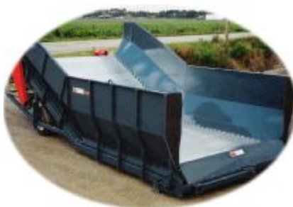
BULK RECEIVING HOPPERS