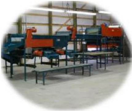
COMPLETE GRADING & PACKING LINES